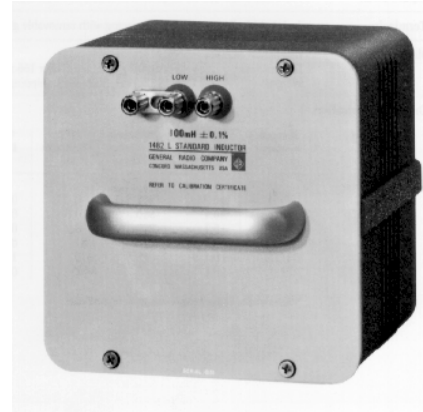
Figure 1: 1482 Inductance Standard